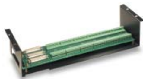
Rack3 rack-mount kit for the DBK206