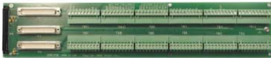
The DBK206 provides removable screw-terminal connectors for DaqBoard/2000 series I/O